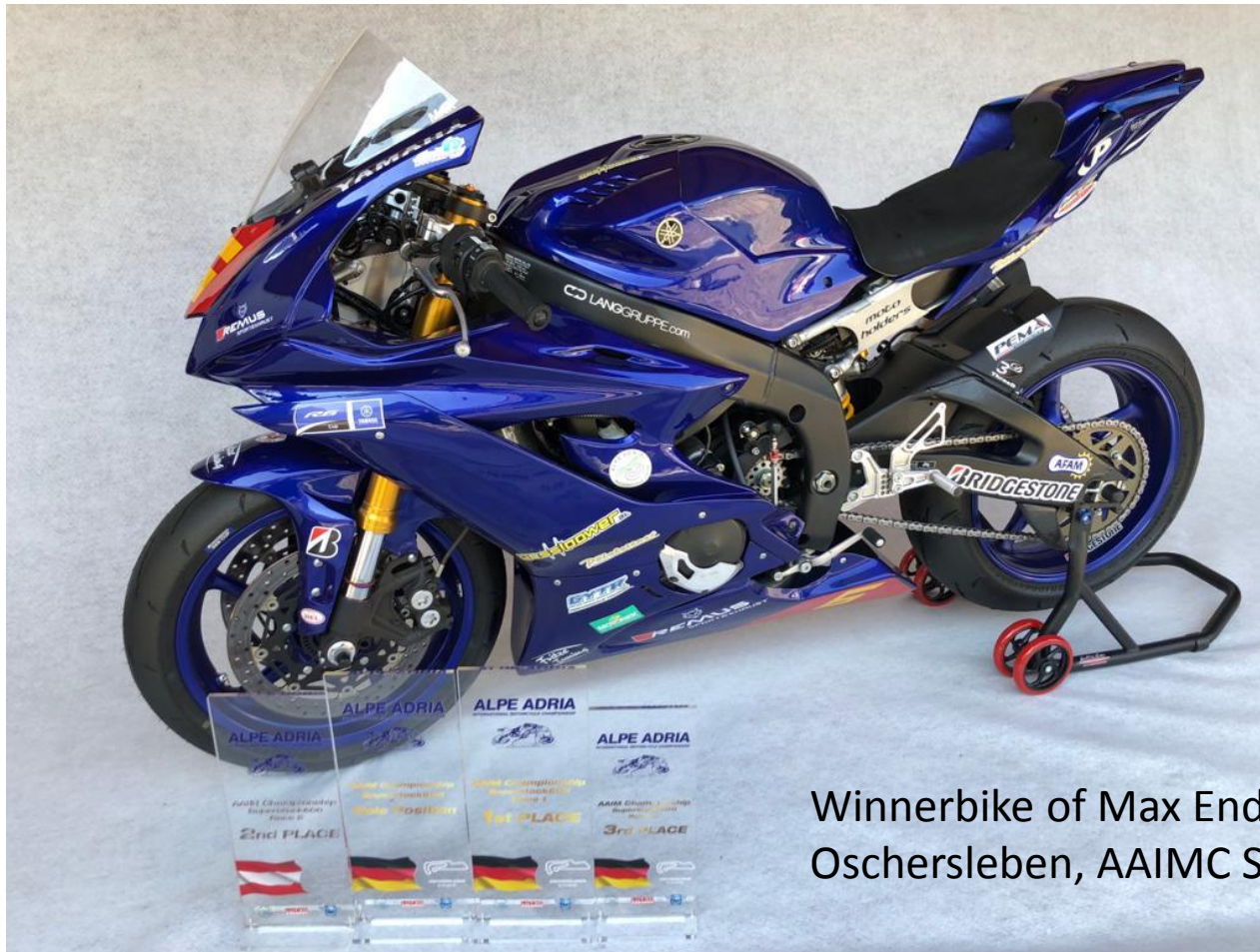
Winnerbike of Max Enderlein, Oschersleben, AIMC Stocksport 600